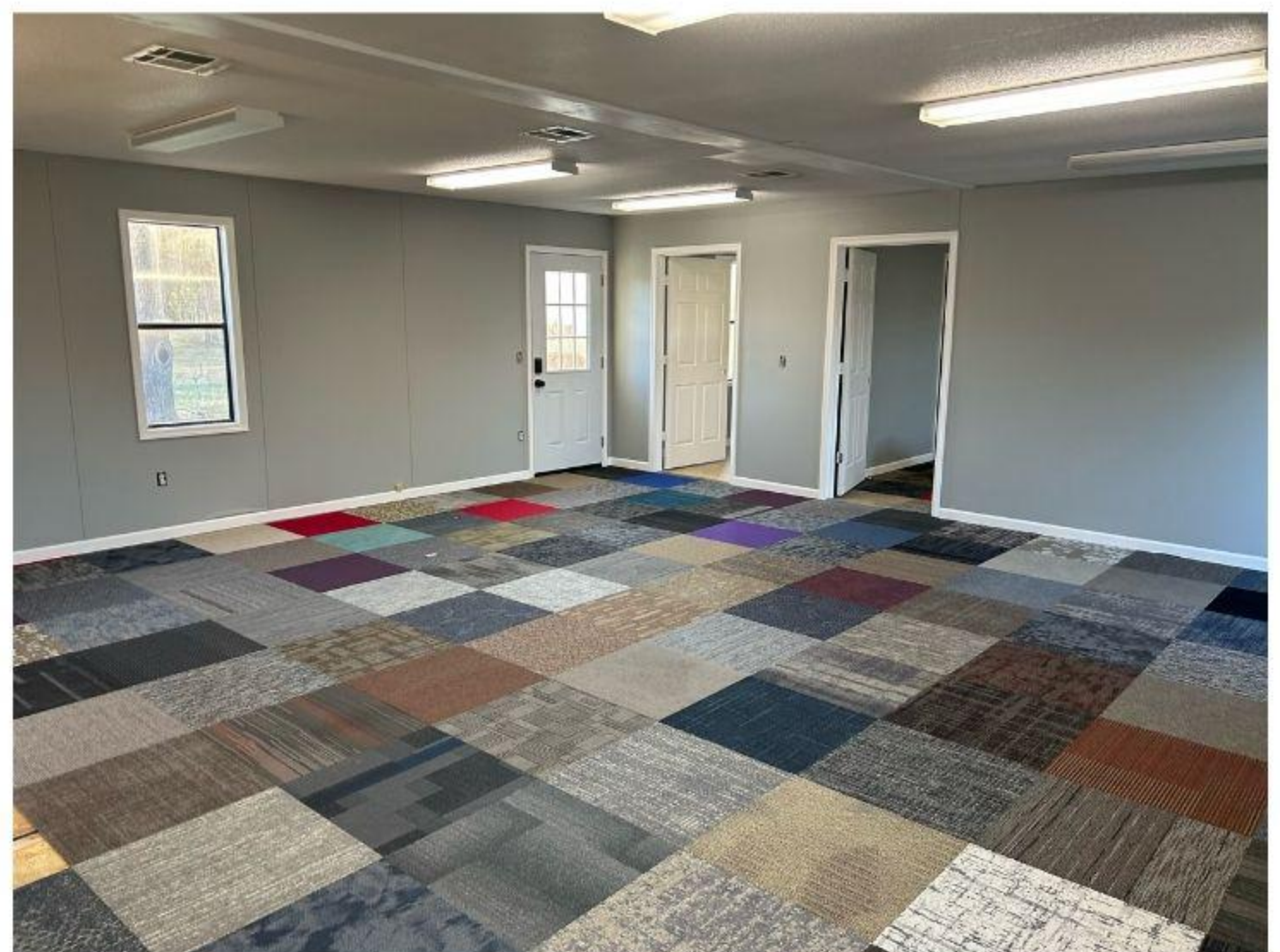
Updated Interior of the Environmental Office

The Mattaponi Tribal Offices will be closed Wednesday, November 22nd through Friday, November 24th, 2023. We will reopen Monday, November 27th, 2023.