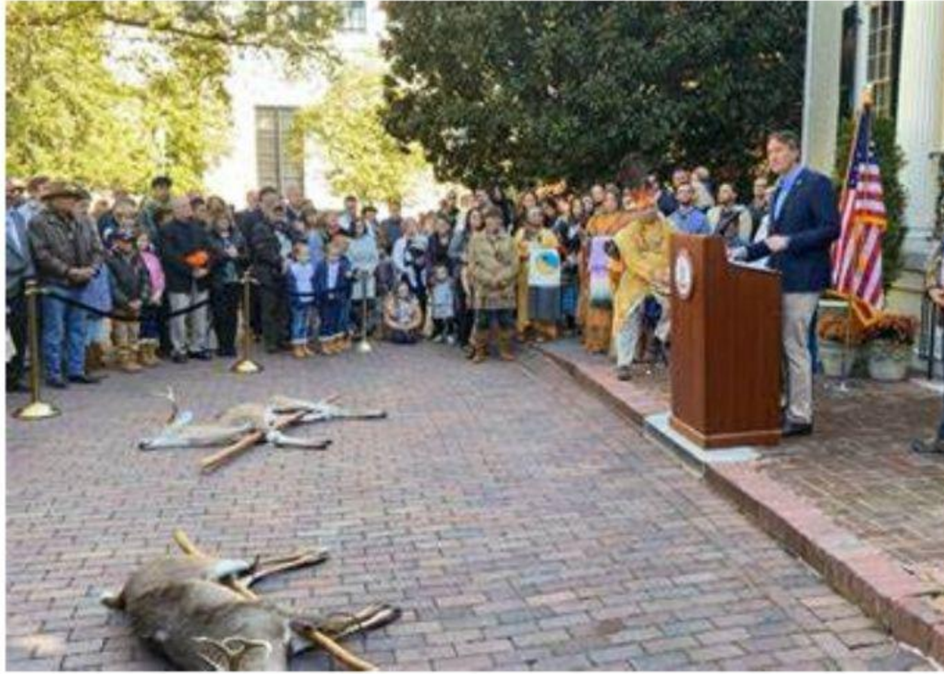
2022 Tax Tribute