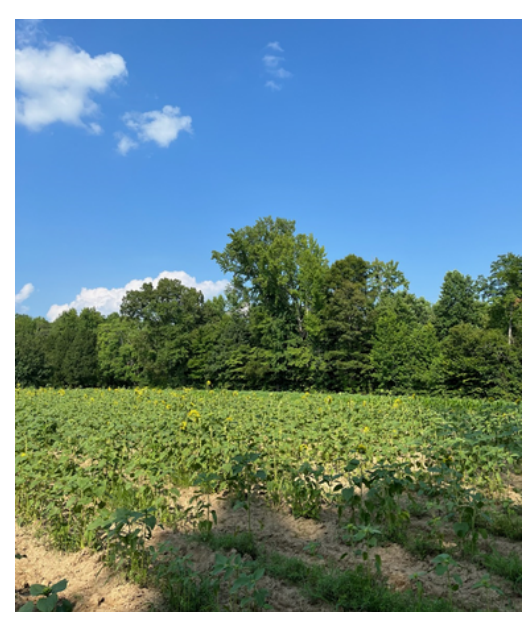
Mattaponi Citizens, Otho Custalow and Calvin Custalow in their vegetable gardens, and a view of the Mattaponi Tribal Community Garden