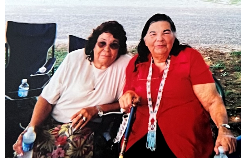
Mattaponi Homecoming circa 1997