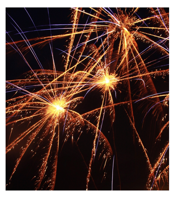
Fireworks on the Mattaponi River

On Saturday, July 8th we had a Tribal Appreciation Day at the Mattaponi Petition Office. Friends and family gathered for a cornhole tournament and a spread of food. At the end of the night, everyone moved to the top of the hill by the river for a firework show. We wanted to give a thank you to everyone who showed up and contributed to this celebration.